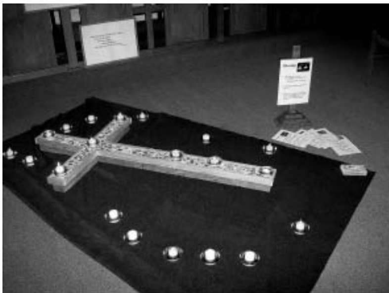
One of the prayer stations at the Day for Prayer & Fasting.