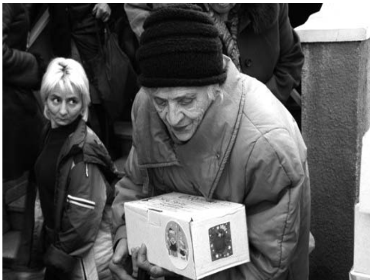
The blond lady is short because she has no legs and is getting around by means of a wooden pallet on wheels!