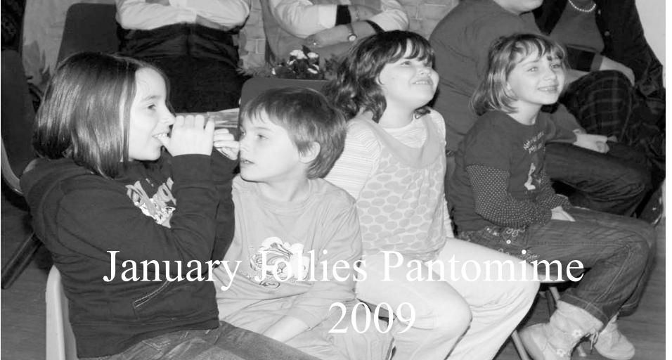
January Follies Pantomime 2009