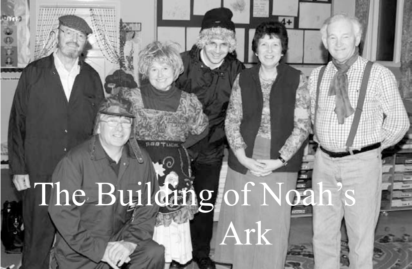
The Building of Noah's Ark