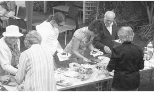
A fine day, some lovely food and good company