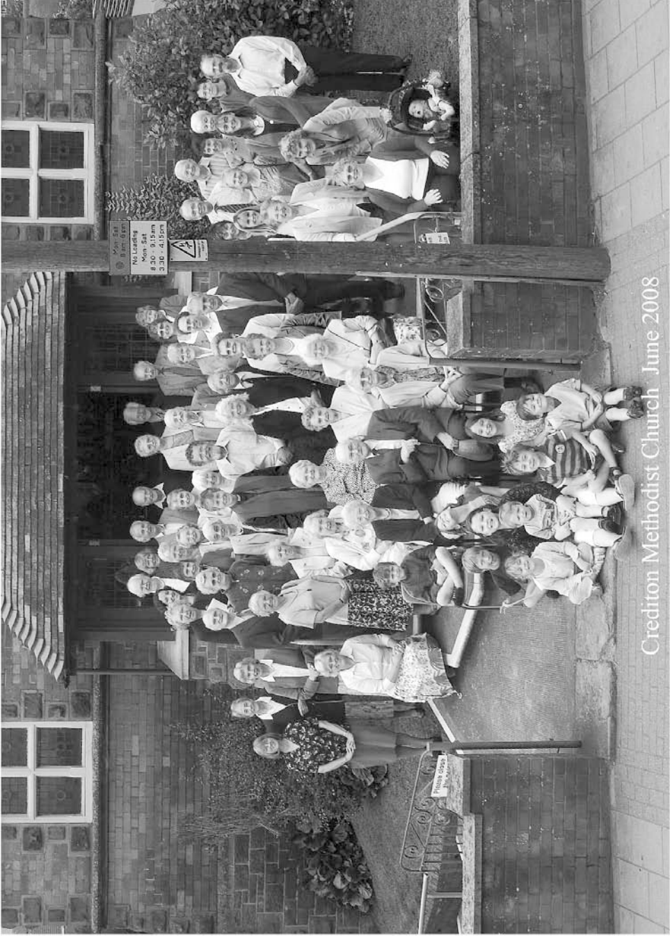
Crediton Methodist Church June 2008