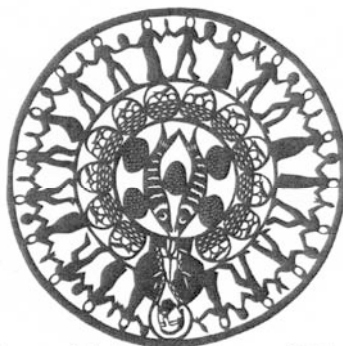
Loaves & Fishes from Whispers of China