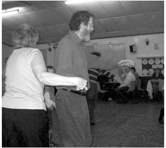
And some people's partners were just not where they should have been!