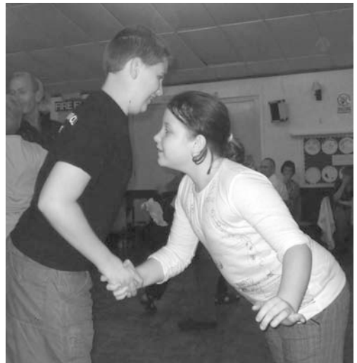
Such elegance - even from the younger generation!