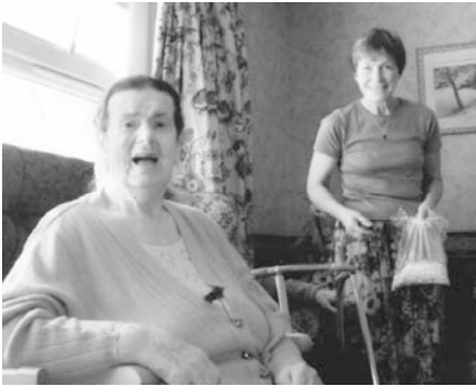
Hillbrow October 07

We are very pleased that we have been supported by church members, and anyone who would like to join us will be most welcome.