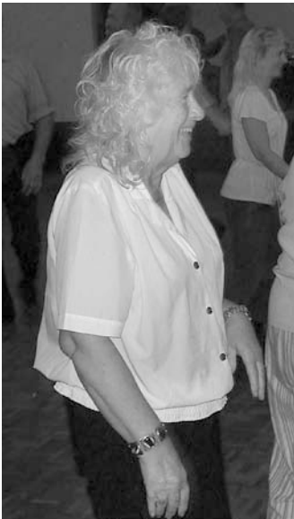
It was good to laugh at others - and even yourself at times.