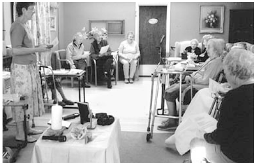
St Lawrence September 07