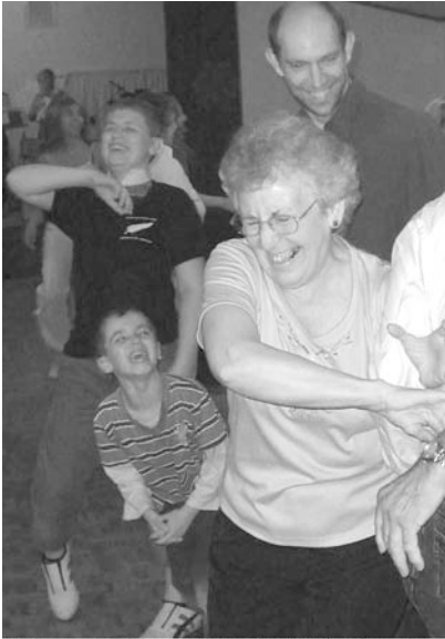
Who would have thought 'Stripping the Willow' could be such fun?