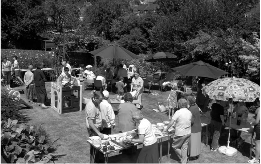
Junior Church Barbeque