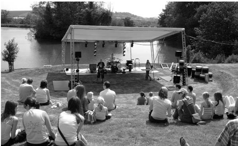
The Sponge, Shobrooke Park