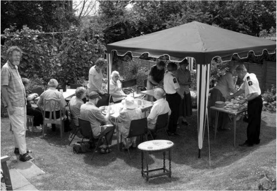
Lunch at the Manse