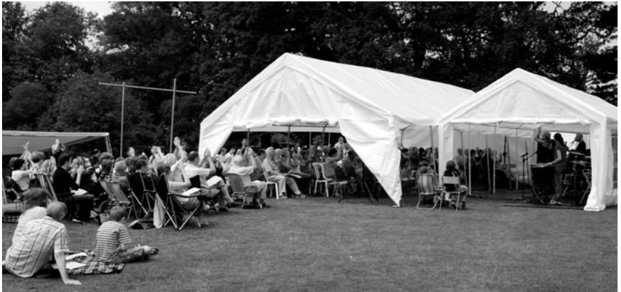
Christians Together Service